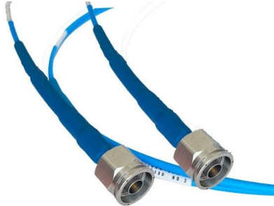
Phase Stable Teflon Cable