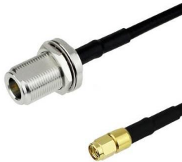
N female to SMA male LMR195-xx.x(M)