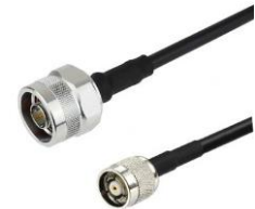
N male to RP-TNC male LMR195-xx.x(M)