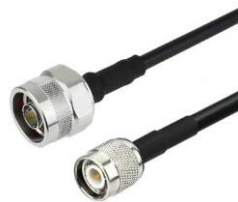
N male to TNC male LMR195-xx.x(M)