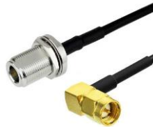
N female to SMA male-RA LMR195-xx.x(M)