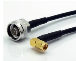
N male to RA-SMA male LMR195-xx.x(M)