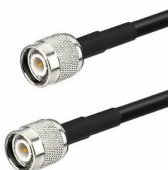
TNC male to TNC male LMR195-xx.x(M)