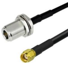
N female to RP-SMA male LMR195-xx.x(M)