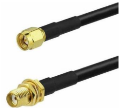
SMA male to SMA female LMR195-xx.x(M)