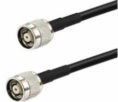
RP-TNC male to RP-TNC male LMR195-xx.x(M)