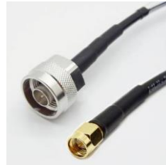
N male to SMA male LMR195-xx.x(M)