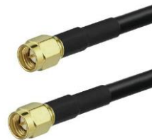
SMA male to SMA male LMR195-xx.x(M)