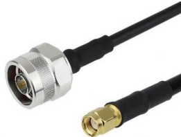
N male to RP-SMA male LMR195-xx.x(M)