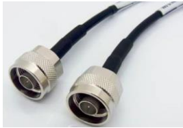
N male to N male LMR195-xx.x(M)