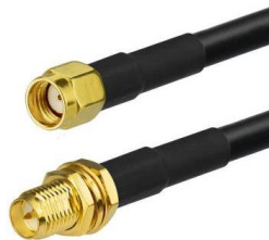
RP-SMA male to RP-SMA female LMR195-xx.x(M)