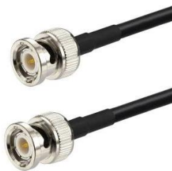
BNC male to BNC male LMR195-xx.x(M)