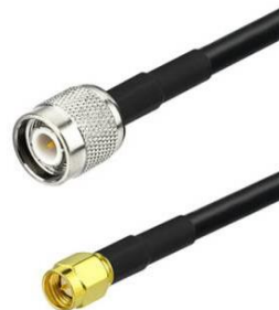
TNC male to SMA male LMR195-xx.x(M)